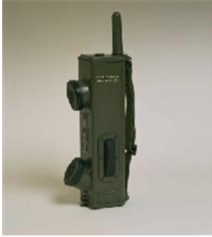
Galvin Manufacturing Corporation (later Motorola) Handie-Talkie SCR536 portable two-way radio, circa 1940.

Many of Motorola's products have been radio-related, starting with a battery eliminator for radios, through the first hand-held walkie-talkie in the world in 1940, and during the War, every thing was Military related